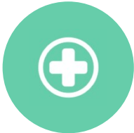
ACUTE CRISIS CENTERS